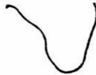
Figure 1: Reproduction is taken from Humphreys and Riddoch (1987:17)

Similar phenomena are described elsewhere. Reporting on patient Mr S., Efron(1968:156) writes: 'Mr S. can point with his finger to an object which is held before him...only if the object is moved before his eyes.' As soon as the object is stationary, the patient is at a loss: 'he does not appear to know what object he has been asked to look at; his eyes randomly scan the entire room and he appears to be "searching."' Landis et al. (1982:522) report a similar case. Their patient could recognize simple geometric figures only if he was allowed to trace them and only 'if the point of departure for tracing was unimportant (e.g., circle, triangle).' The patient could also read aloud slowly. 'This "reading,"' they write, 'was accomplished by rapid tracing of letters, parts of letters or words with his left hand alone or with both hands...[When] movements of the fingers could be prevented...this abolished reading' (ibid.).